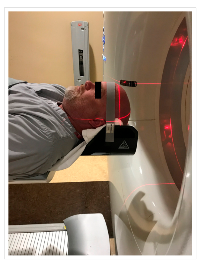
FIGURE 2. Proper head positioning using radiolucent holder with stabilizing accessories.

to be positioned in the field of view. Finally, the vertical placement of the table is checked to ensure that the brain is centrally located in the field of view. The patient should be given clear, detailed instructions on what to expect and the importance of remaining as still as possible.